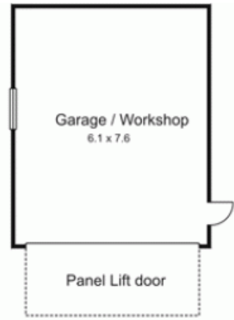
Outbuilding not in actual position to house