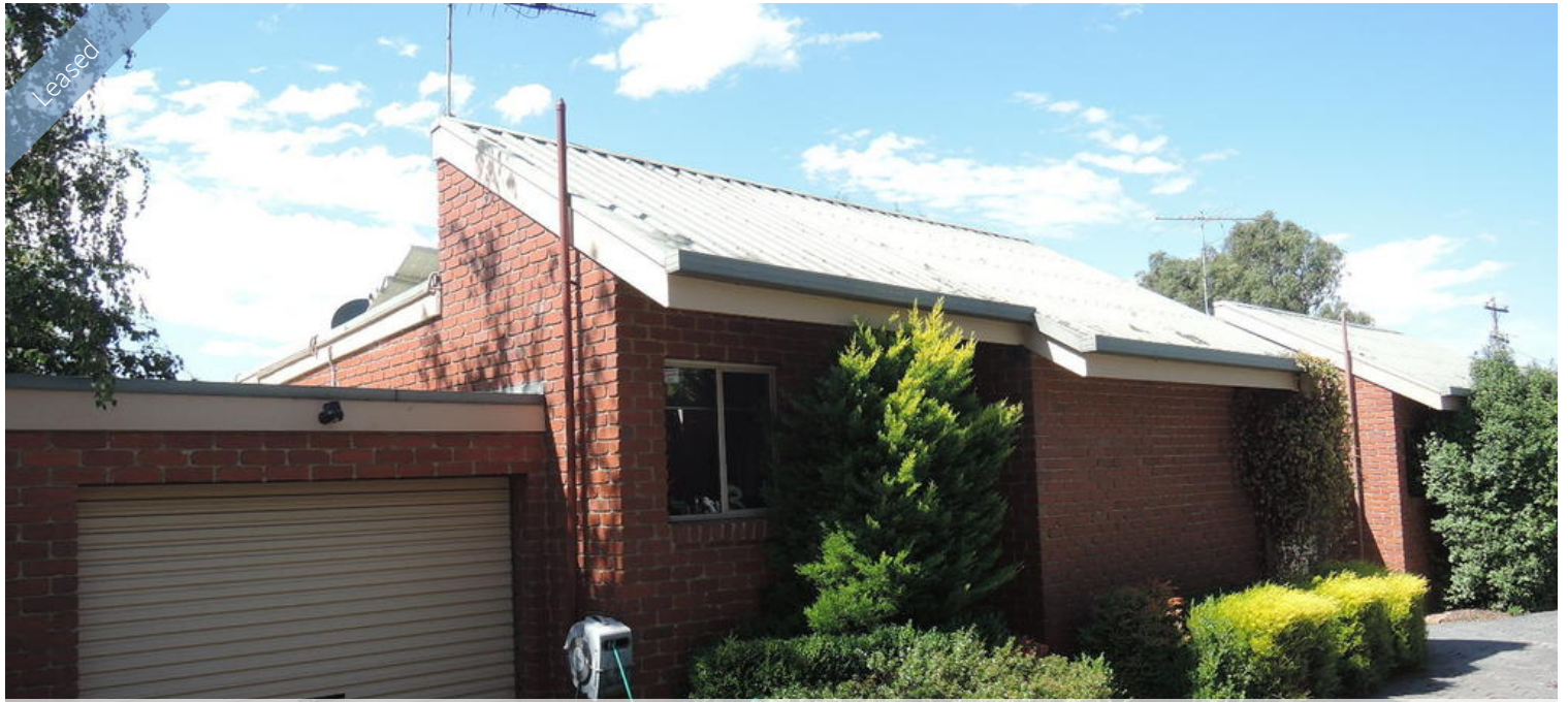
Unit 3, 36 Stephen Street, Gisborne